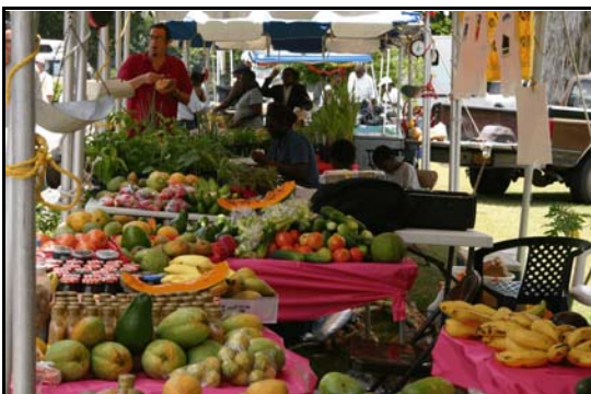
A profusion of tropical fruits grown by St. Croix farmers was on offer at Mango Melee.