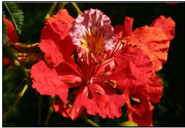
Newly opened Flamboyant flower shows its beauty.

acacias and the familiar tamarind) and the Caesalpinioideae (which contains the cassias and Delonix , our Flamboyant). The Flamboyant usually flowers at the beginning of the rainy season, often before the leaves are produced (though this depends on the climate and the tree). The spectacular display comes from the massed flowers, but individually the flowers are also magnificent (like their relative, the poor-man-orchid or Bauhinia ). The flowers are about five inches across with five scarlet petals. The uppermost petal (the standard) is white or pink, streaked with red. This standard lasts for one day only and the other four petals last for two. The five fleshy sepals are scarlet on the front and yellow behind. Only 20 years ago Flamboyants with