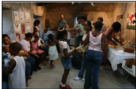
Students of the Creative Adventure Summer Arts Program together with their parents and tutors enjoy the exhibition and reception in the Garden's Education Building.

From the Garden's point of view, it was wonderful to have our resources used in such a positive, educational way. The Education Center was an almost ideal base for the class activities and converted into an excellent gallery for the exhibition of