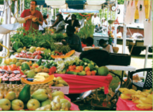
Tropical fruits dominate the scene at our annual Mango Melee festival.

Other highlights of the day will include an Ice-cream Making Demonstration, a Tropical Fruit Identification contest and the ever-popular kids' Mango Eating Contest.