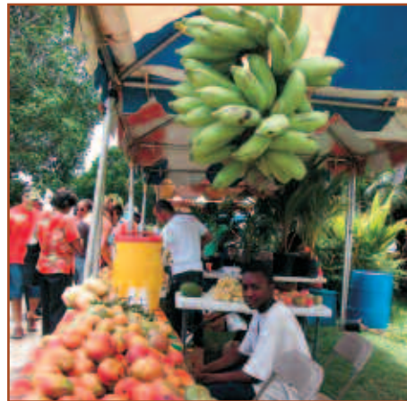
Mangoes and all kinds of tropical fruits will be on display—and for sale—at this year's Mango Melee.